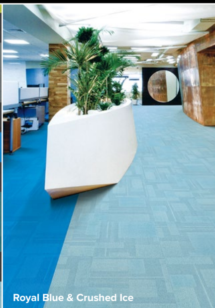
Royal Blue & Crushed Ice