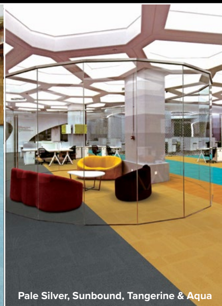
Pale Silver, Sunbound, Tangerine & Aqua