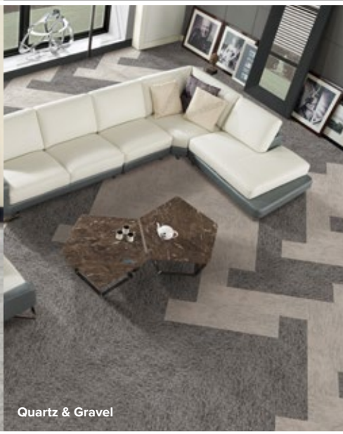
Quartz & Gravel