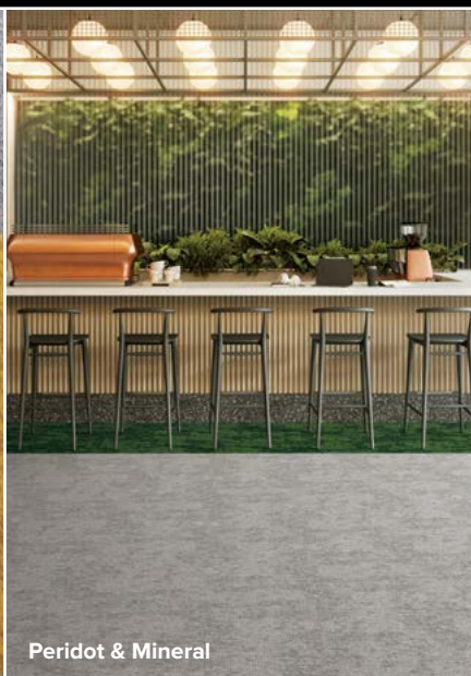
Peridot & Mineral