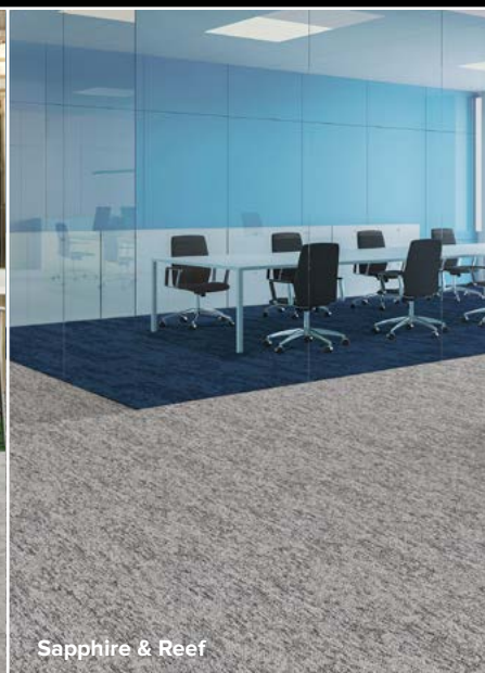
Sapphire & Reef