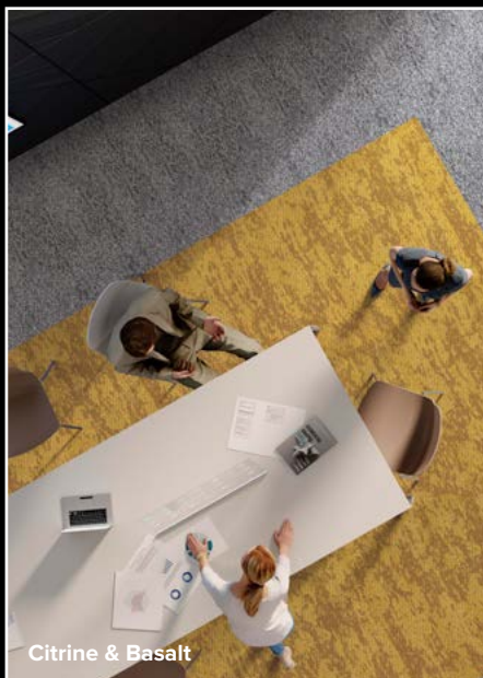
Citrine & Basalt