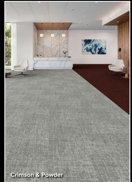
Crimson & Powder