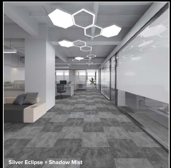
Silver Eclipse + Shadow Mist

Specifications are subject to manufacturing tolerances and may be changed without notice. Colour variation may occur between sample and supplied products due to dye lot tolerances.