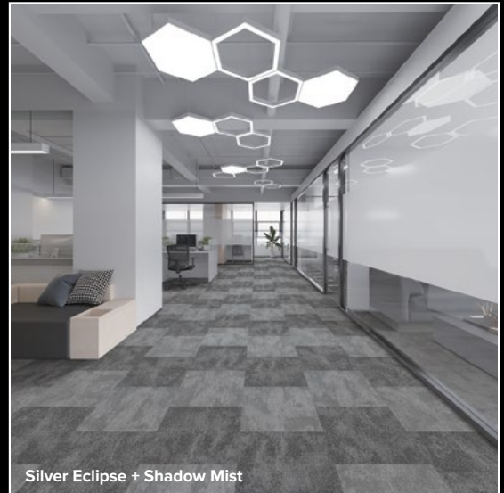
Silver Eclipse + Shadow Mist

Specifications are subject to manufacturing tolerances and may be changed without notice. Colour variation may occur between sample and supplied products due to dye lot tolerances.