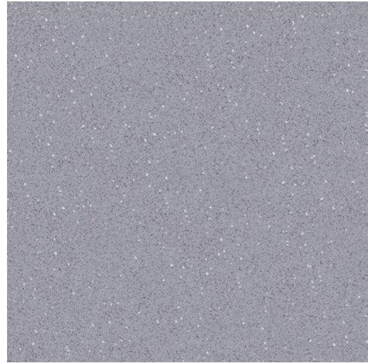
FOG GREY CHIP