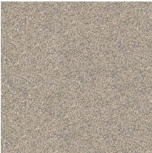
SANDY BEIGE CHIP