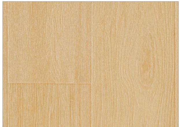
NATURAL - 2205