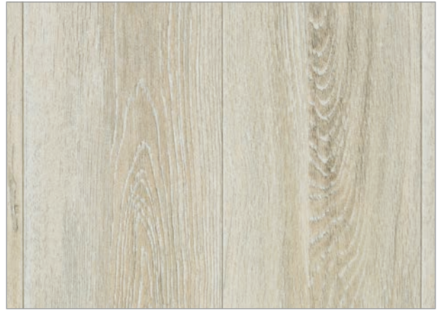
AURORA - 2123