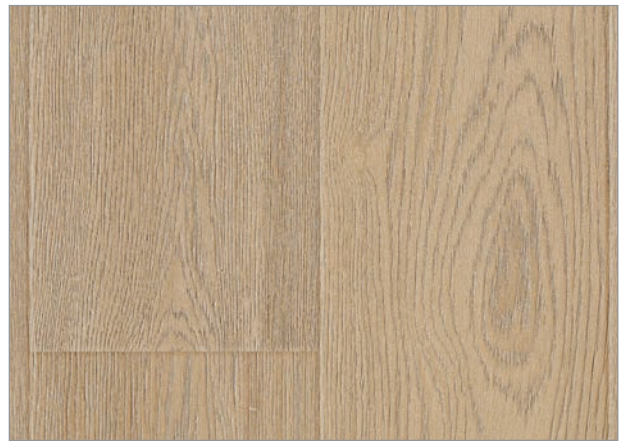
RAWHIDE - 2203