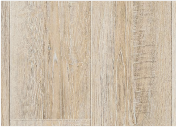
ARCTIC - 2122