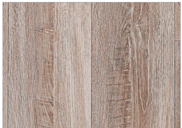
BARK - 2125