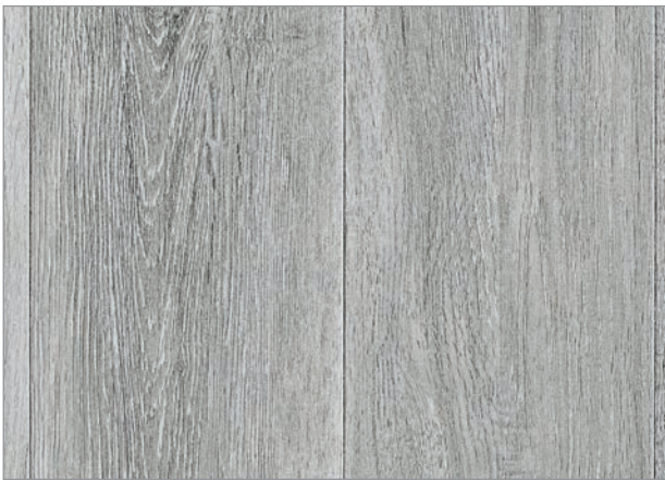
ASH - 2208