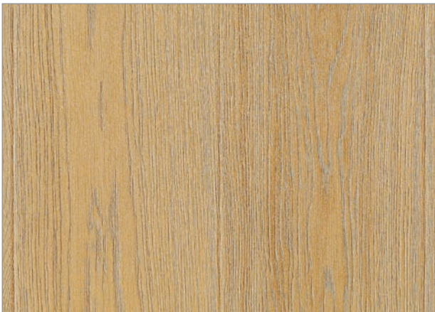
HARVEST - 2206